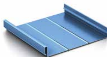
Small Pencil Ribs