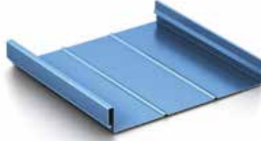
Small V Ribs